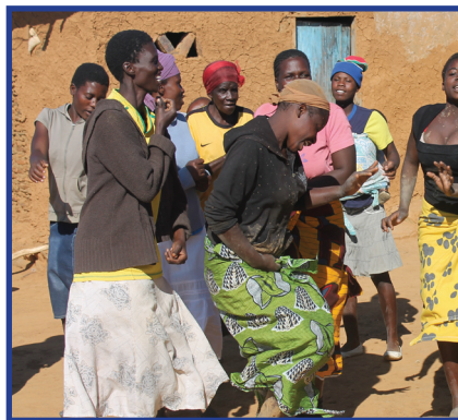
The happier times at McDonald Bricks site captured in this photo (2016)