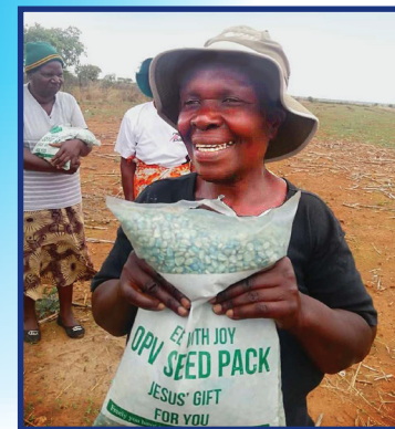
We see a glimpse of "the true light" in the brilliant smile here of a lady clutching a bag of seed maize – itself a gift of hope

"...the darkness is passing and the true light is already shining" (1 John 2:8b)