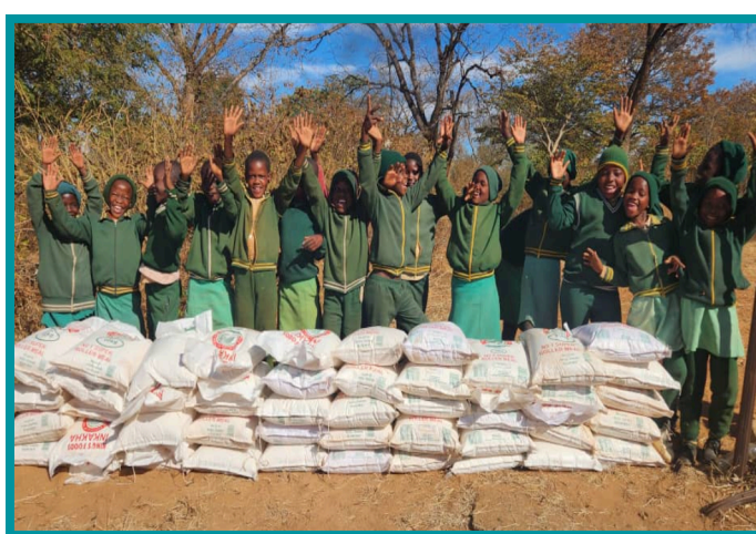
A very big thank you from Mlonyeni Primary school

A gift left to ZVSF in your will, no matter the size, can make a lasting difference to communities in Zimbabwe. If this is something you would like to consider or discuss, we would be very glad to hear from you and provide more information.