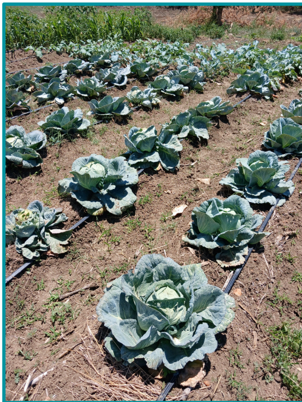
Crops and vegetables at Intuthuko garden project

Caroline Hastie-Smith 45 Barnsley, Cirencester GL7 5EE Tel: 07747 794934