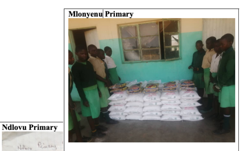
Mlonyeni Primary girls receiving their food