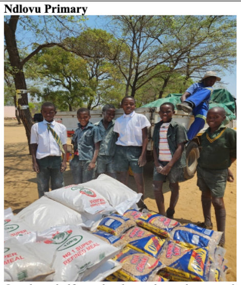
Our dusty half-way brothers, always happy to help us offload.